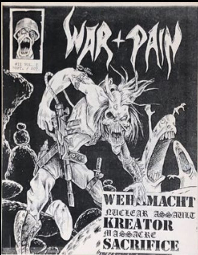
Ivey, Justin WAR & PAIN: Issue II, Vol. I Saginaw, MI, 1986

Black and white typed and photocopied thrash zine from Michigan featuring interviews with Kreator, Wehrmacht, Massacre, and Sacrifice. Also includes a tribute to fallen bassist of Metallica Cliff Burton. Includes photographs of bands, but also contemporary drawings indicative of the thrash era style with horror influenced graphics. Name taken from the Voivoid EP from 1984. Staple bound, unpagged and 8-1/2 x 11" size with minimal wear and tear. Scarce. $75