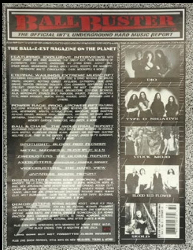
LaDuke, David BALLBUSTER: The Official Int'l Underground Hard Music Report: Vol. 1, Strike 3 Louisville, KY, 1997

Black and white typed and photocopied thrash zine from Michigan featuring interviews with Kreator, Wehrmacht, Massacre, and Sacrifice. Also includes a tribute to fallen bassist of Metallica Cliff Burton. Includes photographs of bands, but also contemporary drawings indicative of the thrash era style with horror influenced graphics. Name taken from the Voivoid EP from 1984. Staple bound, unpagged and 8-1/2 x 11" size with minimal wear and tear. Scarce. $75